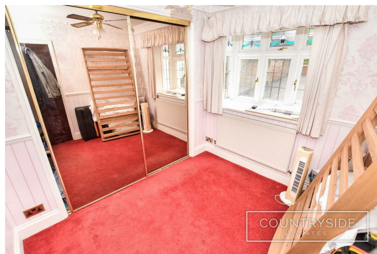
Upvc leaded light double glazed bay window to front. Radiator. Power points. Decorative Coved and skimmed finished ceiling. Ornamental ceiling rose. Double mirror fronted floor to ceiling wardrobes. Door to bathroom.