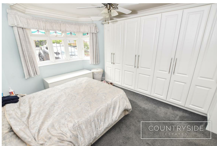
Upvc leaded light double glazed bay window to front. Radiator. Decorative Coved and skimmed finished ceiling. Ornamental ceiling rose. Dado rail. Power points.