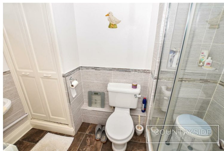
White suite comprising close coupled W.C. Pedestal wash hand basin. Double width fully tiled shower cubicle with extractor fan. Attractive half tiled walls with dado tiled border. Leaded and stained glass upvc double glazed window to flank. Coved and skimmed finished ceiling with inset ceiling lights. Towel radiator. Cupboard housing gas central heating boiler.