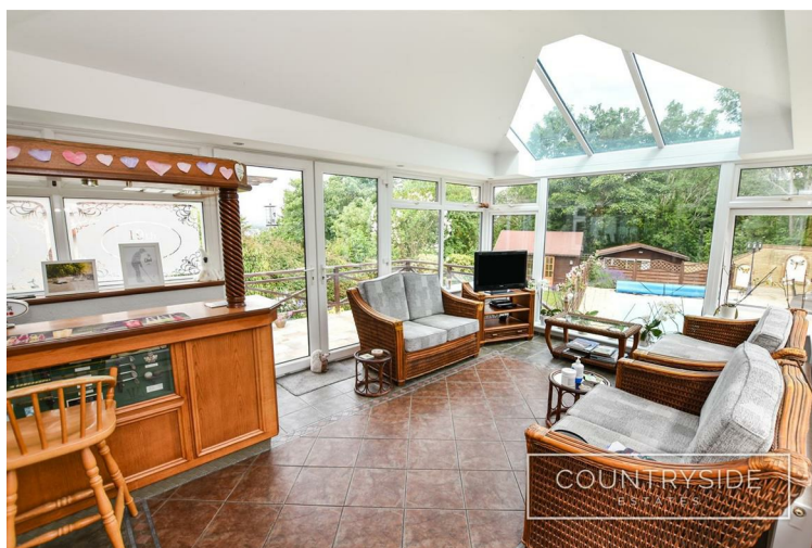
A superb, bright and spacious room with full height picture window to rear enjoying delightful outlook over garden. Door to side. French doors to other side leading onto raised patio area. Oak bar to remain. Radiator. Attractive ceramic tiled floor.